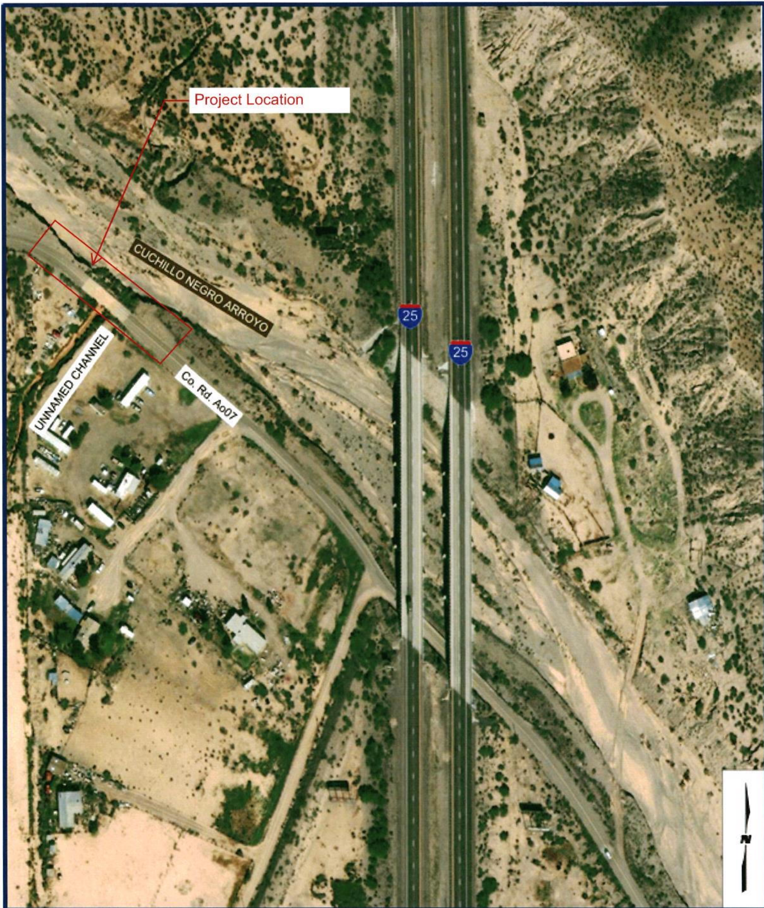
Sierra County - County Road No. Ao07 Roadway and Drainage Improvement Project NMDOT Transportation Call For Projects- TPF FY 22/23