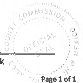
Cara Cooke, County Clerk

A blue ink signature of Cara Cooke, County Clerk.